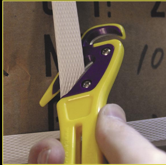
Safe operation with straight blades in use for general strap cutting.