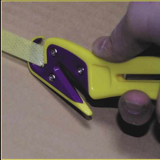
Safe operation with ring blade in use for Pop 'n Trot utilization.